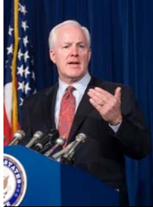
U.S. Senator John Cornyn

U.S. Senator John Cornyn (R-TX) will address LCJ members at the Member Breakfast on Tuesday, May 6th, at the St. Regis Hotel from 8:15 a.m.—8:45 a.m. Senator Cornyn is a member of the Senate Judiciary Committee.